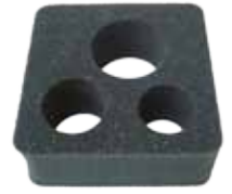
Air Can Holder

1. Remove the cap from the Air Adaptor and screw the Air Adaptor into the base of the Air Grip.