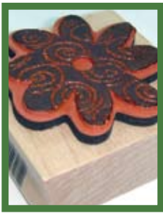
Flower from Inkadinkado

Since Copic Markers are alcohol based, you'll want to avoid coloring in images stamped with solvent inks like StazOn.