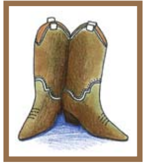
Boots from Lockhart Stamp Co.

When using colored pencil, lay your marker color down first, then color over it with your colored pencil. This will keep your tip from getting discolored. If you do put pencil down first, and you get it on your marker tip, quickly scribble onto scratch paper to get it off your tip. It won't ruin your tip, it will just look bad.