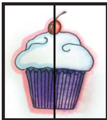
Versafine ink on Classic Crest Colors used: B32, R29, RV21, BV04, V04, 0 Cupcake from Lockhart Stamp Co.